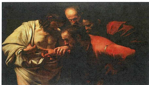
Caravaggio – The Incredulity of Saint Thomas, c. 1601–1602.

Please send in bulletin notices by Thursday