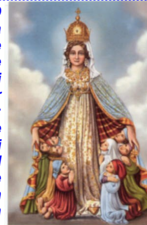
Madonna di Monte Berico VICENZA

SUPPLICA ALLA MADONNA DI MONTE BERICO O Vergine Santissima, Madre di Dio e Madre mia Maria, Ti ringrazio che Ti sei degnata di apparire sul Monte Berico e Ti ringrazio per tutte le grazie che qui concedi a quanti a Te ricorrono. Nessuno mai Ti ha pregato invano. Anch'io a Te ricorro e Ti supplico per la Passione e Morte di Gesu' e per i Tuoi dolori: accoglimi, o Madre Pietosa, sotto il Tuo manto, che e' manto materno; concedimi la grazia particolare che Ti domando... e proteggimi da ogni male e specialmente dal peccato che e' il male piu' grande. Deh! fa, o Maria, Madre mia, che io goda sempre della Tua amorosa protezione in vita e piu' ancora in morte e che venga poi a vederTi in cielo e a ringraziarTi e benedirTi per sempre. Amen. Madonna di Monte Berico, prega per noi.