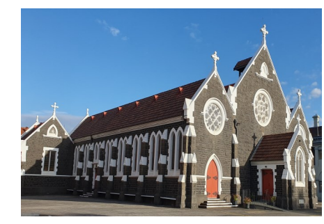
We acknowledge the Wurundjeri people, the traditional owners and custodians of the land on which we stand. We pay our respects to them for their care of the land. May we walk gently on this

T'incoronano dodici stelle. Al tuo piè piegan l'ali del vento Della luna s'incurva l'argento Il tuo manto ha il colore del ciel. Rit.