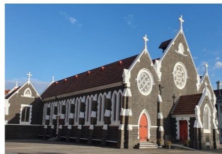
We acknowledge the Wurundjeri people, the traditional owners and custodians of the land on which we stand.

COMMUNION ANTIPHON: Christ our Passover has been sacrificed, alleluia; therefore let us keep the feast with the unleavened bread of purity and truth, alleluia, alleluia.