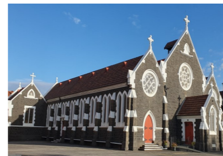
We acknowledge the Wurundjeri people, the traditional owners and custodians of the land on which we stand.

T'incoronano dodici stelle. Al tuo piè piegano l'ali del vento Della luna s'incurva l'argento Il tuo manto ha il colore del ciel. Rit.