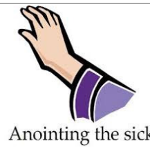
Anointing the sick