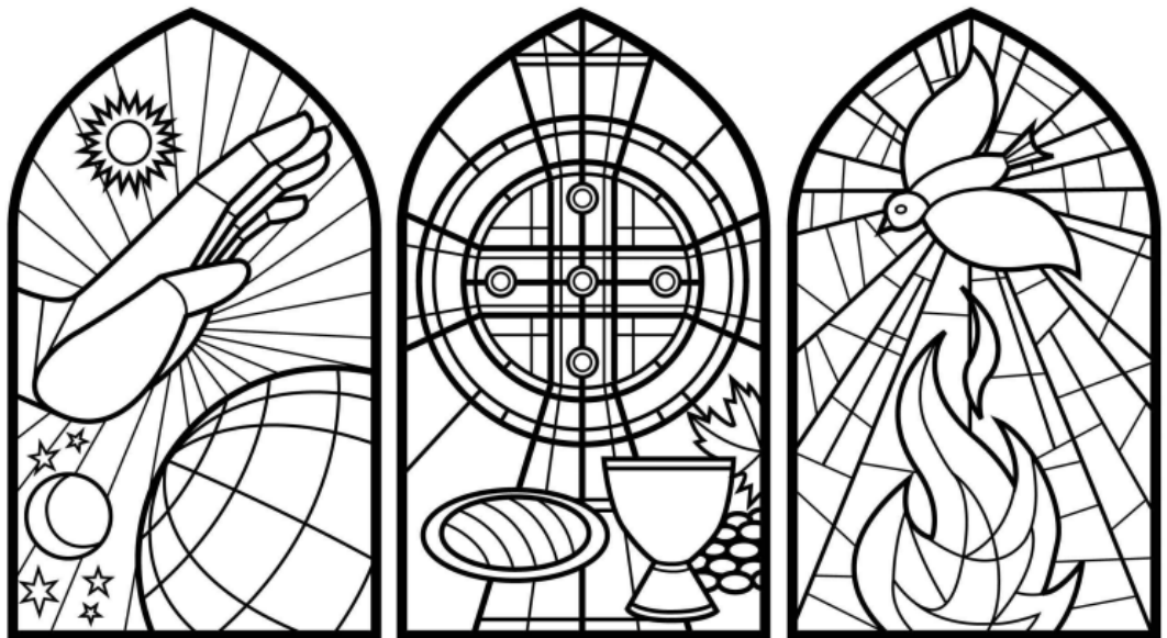
Colour in the Trinity stained glass windows.