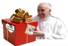
CSOE Response To Evangelii Gaudium

This course acknowledges Pope Francis' tremendous gift to the church – Evangelii Gaudium.