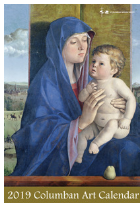
2019 Columban Art Calendar

We will again selling Columban Calendars and Christmas Cards at all Masses commencing 17th November 2018 Columban Calendars $9.00 Christmas Cards (pack 8) $5.00