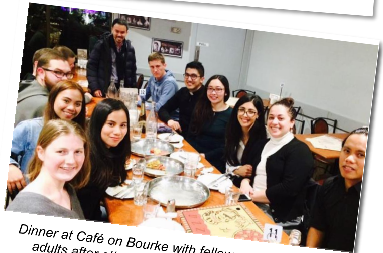
Dinner at Café on Bourke with fellow young Catholic adults after attending Holy Hour at St. Patrick's Cathedral.