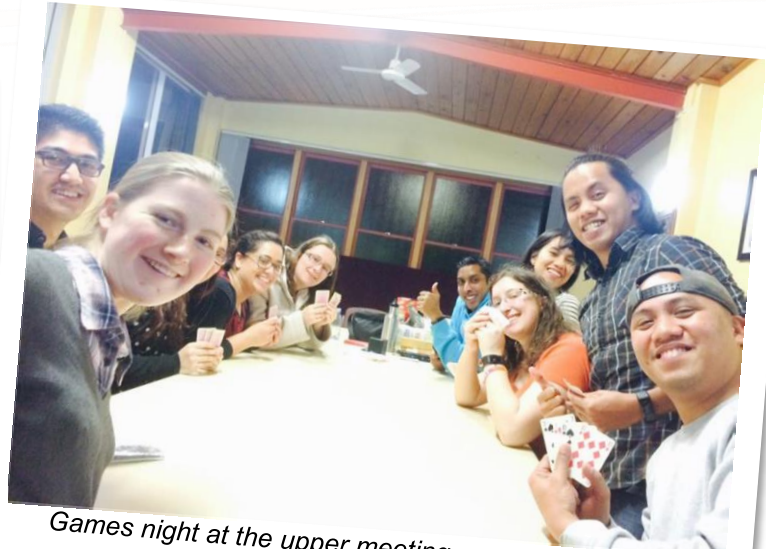
Games night at the upper meeting room of St. Brigid's Church.