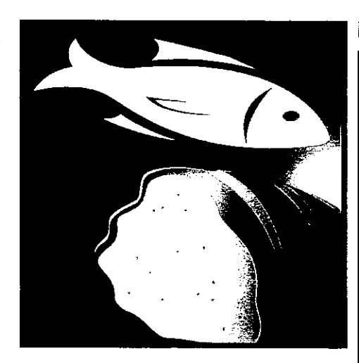
Gospel Lk 9:11-17