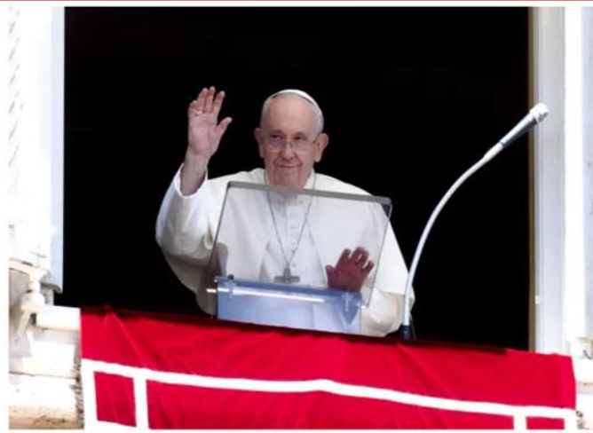
Pope Francis delivers the Angelus address in St. Peter's Square, July 31, 2022.

Among those hit the hardest, the pope mentions stores, workshops, cleaning businesses, transport businesses, and others "that don't appear on the world's richest and most powerful lists."