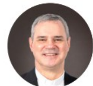
Most Rev Peter A Comensoli ARCHBISHOP OF MELBOURNE