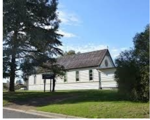
Our Lady Help of Christians, Broadford