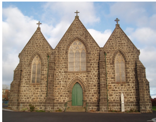
St Patrick's, Kilmore