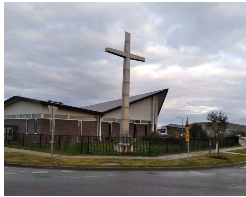
Our Lady of the Way, Wallan