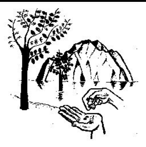
Mustard Seed Faith: 27th Sunday in Ordinary Time: Year C