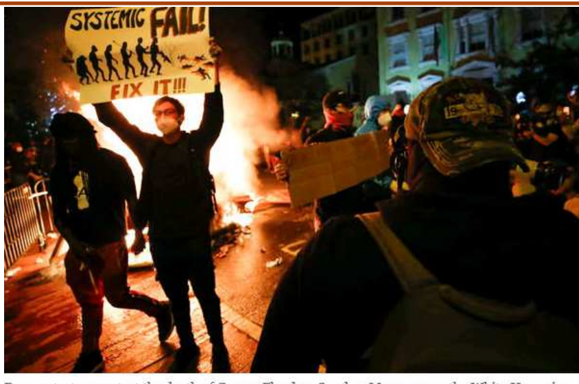
Demonstrators protest the death of George Floyd on Sunday, May 31, near the White House in Washington.

Every day, it seems, brings another indicator of our decline: the can-do nation has become a land that can't deal with a pandemic, the