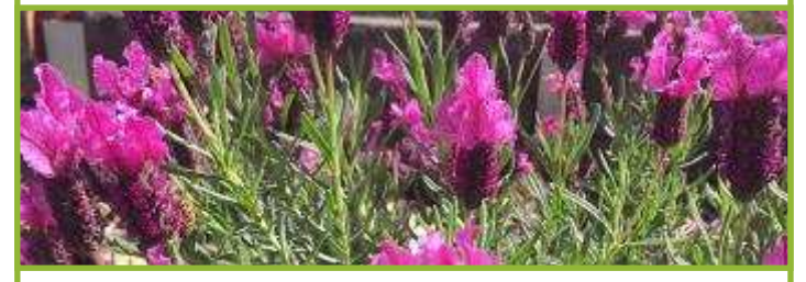
Spring in Montmorency...