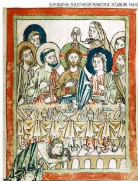
The thirteenth-century Besançon Psalter, produced by Cistercian nuns

There are variations of details, which is what you would expect of an event that happened several decades before a written record was made. Jesus spoke of its importance, but different reasons are highlighted by different evangelists for what it meant: anticipation of his burial,