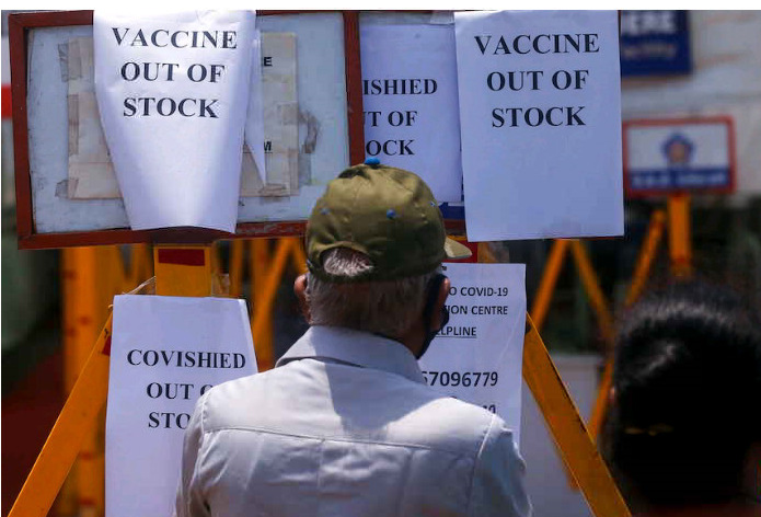
Several states in India have reported a shortage of coronavirus vaccine doses.

vaccinate at least 20 per cent of their population - frontline healthcare workers and their most vulnerable people. Prior to India's second wave, the scheme was already short on the number of doses it had delivered worldwide. Now, it will be further behind.