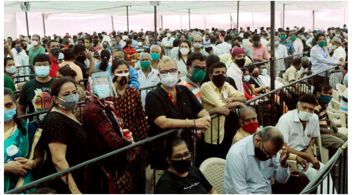
People wait in line for coronavirus vaccinations in Mumbai, which is recording thousands of new infections every day.