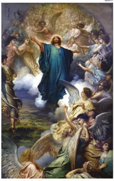
Gustave Doré, The Ascension, 1897

The connection of the Ascension with the promise of the return of Christ and the culmination of the present age is expressed in the Apostles' Creed: "He ascended into heaven, and