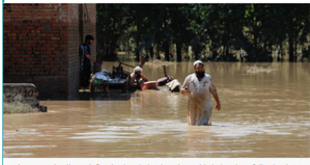
A man wades through floodwaters trying to salvage his belongings following heavy Aziz, Reuters)

The Albanese Government has announced it will provide $2 million in humanitarian aid to help those affected by the floods that have devastated Pakistan. Source: SBS News.