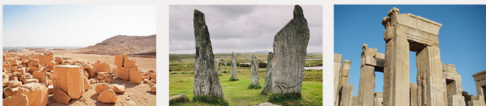
KEEPING FAITH WITH OUR ANCESTORS Voices of Our Female Ancestors

https://cac.org/daily-meditations/the-continuum-of-life-2022-10-30/