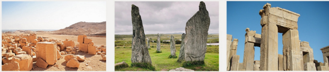
KEEPING FAITH WITH OUR ANCESTORS Part of One Body