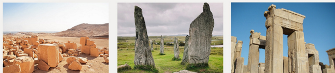
KEEPING FAITH WITH OUR ANCESTORS The Continuum of Life