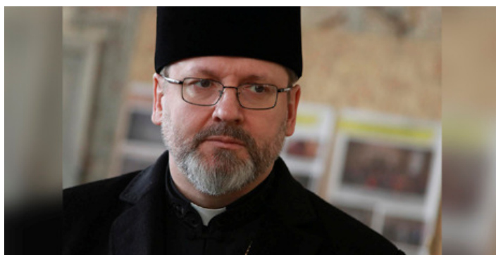
Major Archbishop Sviatoslav Shevchuk

https://cathnews.com/2022/12/14/war-will-not-stop-christmas-ukrainian-archbishop/