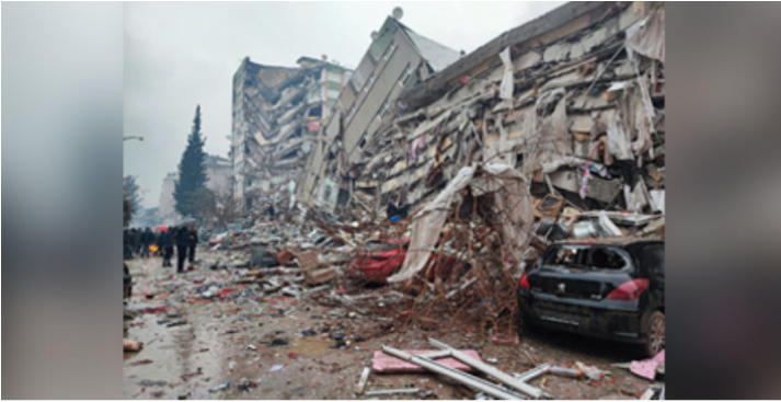
Collapsed buildings in Kahramanmaraş, Türkiye, on February 6

The Catholic bishops of Oceania have sent a message of prayerful condolence and solidarity to Church and civic leaders in Türkiye and Syria as the countries suffer the effects of devastating earthquakes.