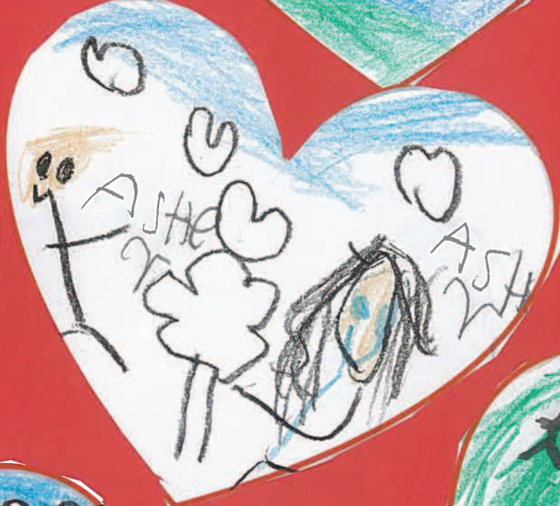
Love is loving mum or dad. Asher