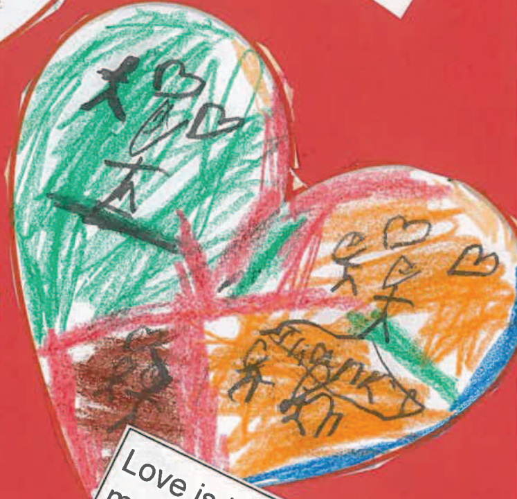
Love is loving your mum. Ciaran