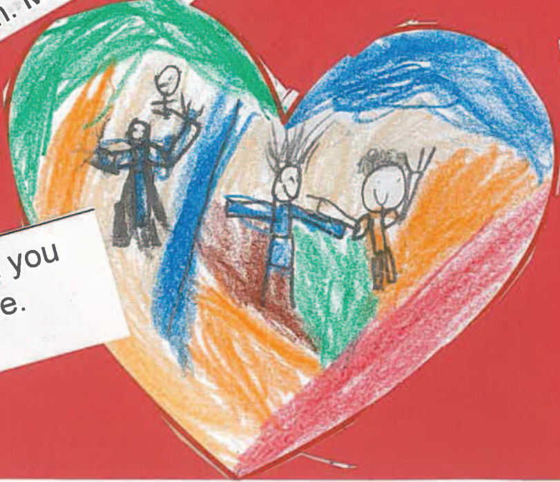
Love is when you hug someone. Lennix