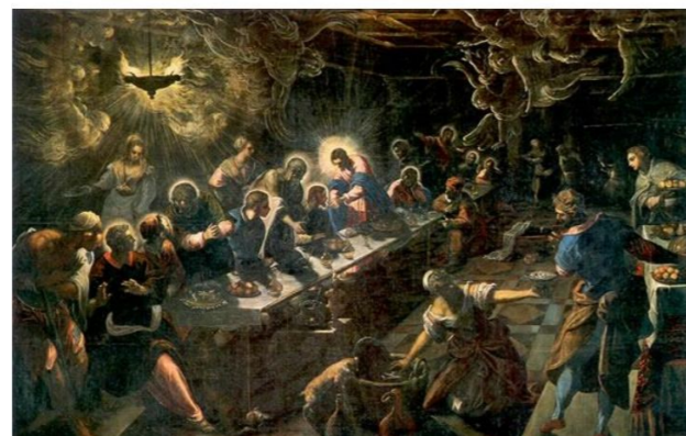
Tintoretto, Last Supper, 1594