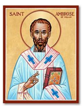
St Ambrose-Memorial 7th December