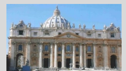
St. Peter's Basilica Rome, Italy

The Church received the beginning of her knowledge of things divine through Sts. Peter and Paul, and these two apostles are most responsible for the spread of Christianity. The truth was handed down to us by them, and we are governed under their patronage (Roman Missal).