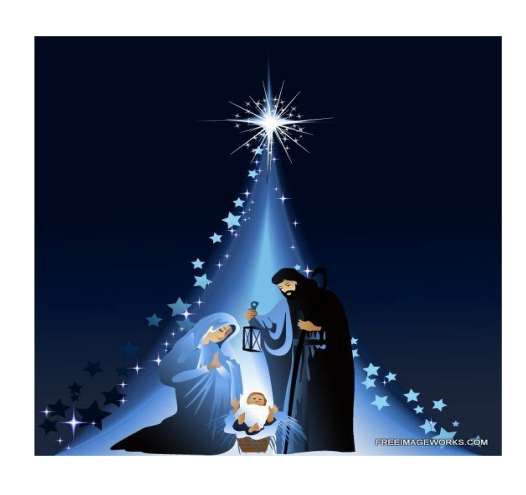
Christmas Eve Mass (Saturday 24th December )