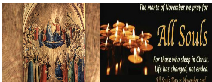
All saints day

Bookings: Try booking or contact Parish office on 97542141 before Saturday 12 noon.