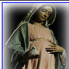
Mary Waited for the birth of Jesus