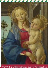
2021 Columbian Art Calendar