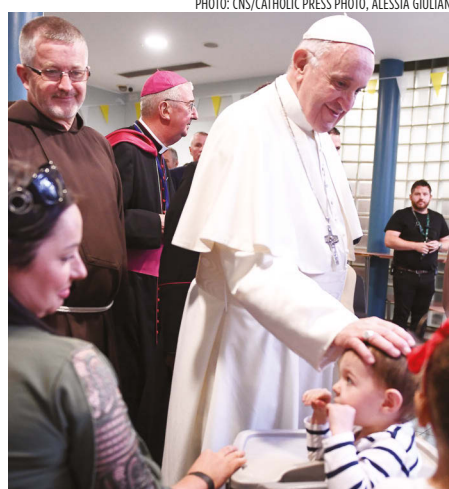
The Pope at the Capuchin Fathers' day centre

One more thing and then [turning to the poor] I will speak to you. Another thing that you said touched my heart. That you don't ask any questions. It is Jesus who comes [in the poor]. You ask no questions. You accept life as it comes, you give comfort