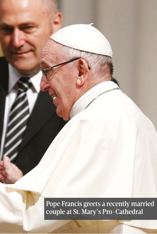
Pope Francis greets a recently married couple at St. Mary's Pro-Cathedral