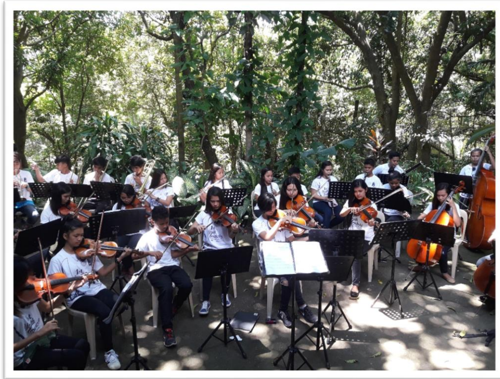
One of the performances of the youth orchestra – August 2017.