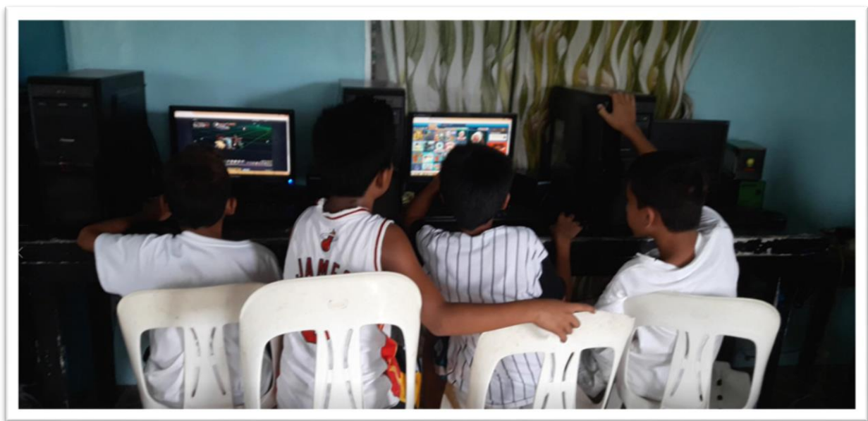
Children in the internet room learning music, interacting with their teachers online, and in their free time.