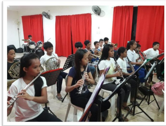
The beginners' section of the orchestra during one of their daily rehearsals.