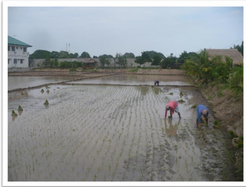
Rice fields – the main source of employment in the area of Pagalanggang.