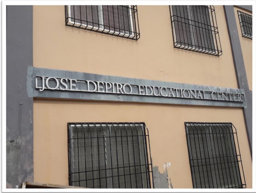
The entrance to the centre.