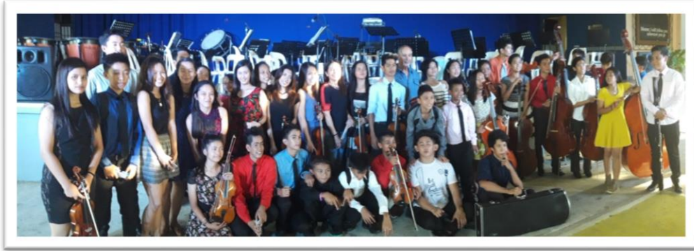
The Kabataan (Youth) Orchestra – 13th August 2017