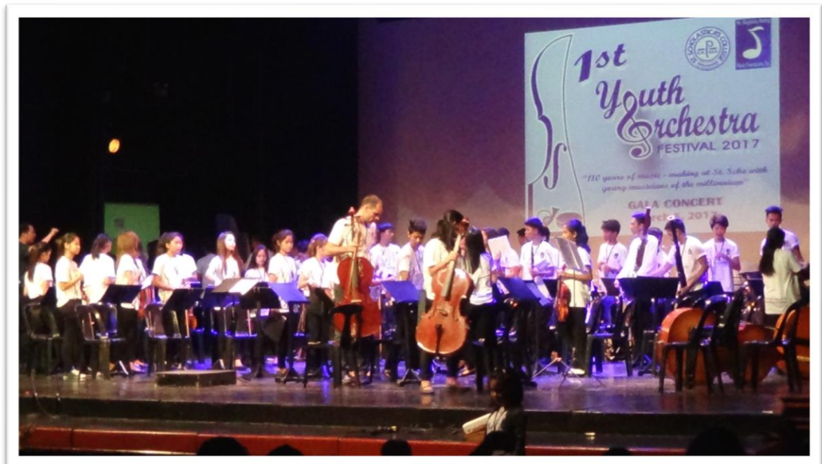
One of the youth orchestra performances in Manila - 2017