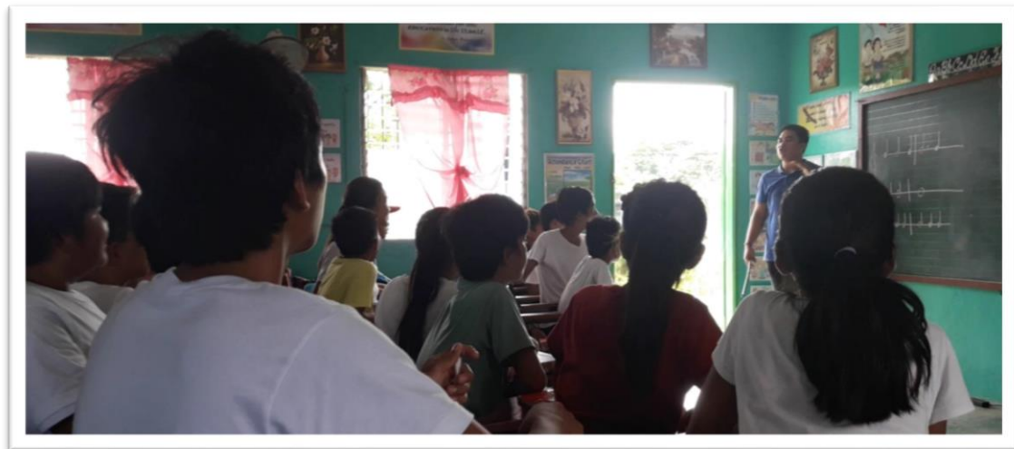
Teaching Music and arts in schools is also part of the Jose De Piro Center for Arts mission.

centre, two members of the orchestra are currently specialising in music at the St Scholastica College of Music, Manila, while two others have passed the admission exam and will start their studies in July 2018. Another female student will be studying theatre arts at the Polytechnic University of the Philippines and another one is preparing to sit for the music admission test at the end of February 2018. The University of St Scholastica has offered a sponsored scheme for these youth to cover both their tuition and miscellaneous expenses, as long as they keep up their high marks. Moreover these students need financial support for their accommodation in Manila and to travel back to their families on the weekend.