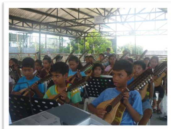
Early days – the members of the Ronadlia.