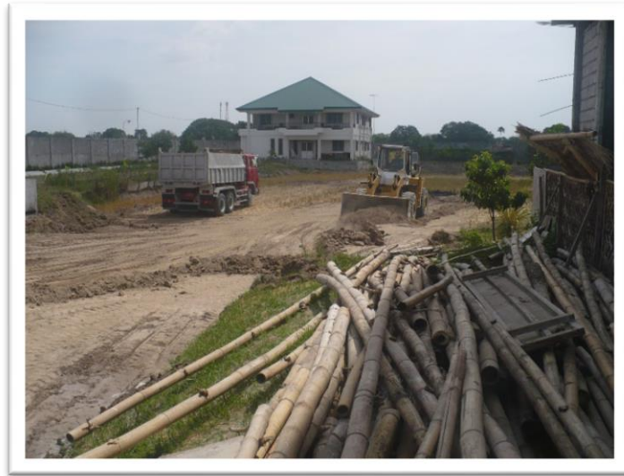
The site today occupied by the Jose De Piro Centre for Arts.