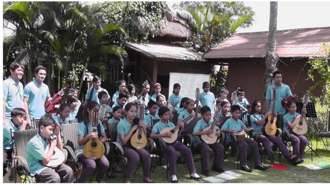
The Ronadlia during a performance.