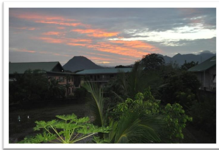
Pagalanggang and the surrounding mountains.

The Missionary Society of Saint Paul (MSSP) took over the Pagalanggang parish in 2005. The principal mission of the society has been to find ways to help the community develop further. The plan was focus human resources.