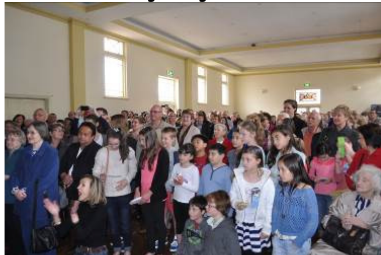
A packed hall to say happy retirement