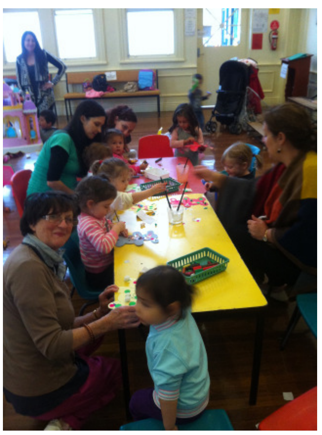
St John's playgroup hard at work creating

Anyone interested in joining the group can come along to the hall any Monday morning during term or call the Playgroup coordinator's number below.