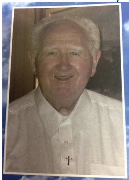
Forever in our Hearts