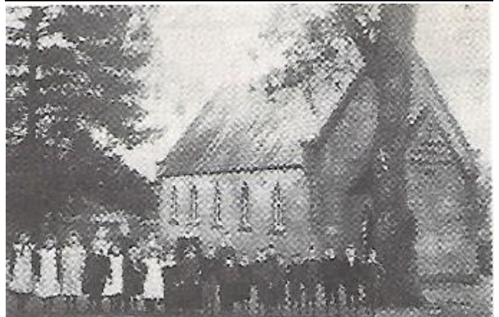
St Johns School, Heidelberg