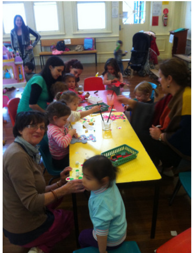
St John's playgroup hard at work creating

Anyone interested in joining the group can come along to the hall any Monday morning during term or call the Playgroup coordinator's number below.