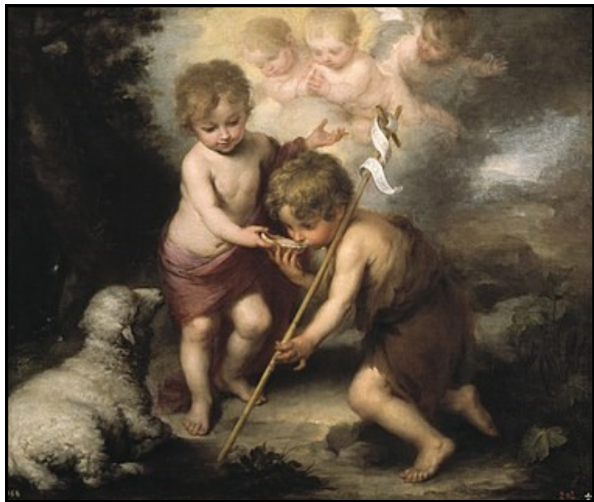
1670-1675 oil on canvas painting by Bartolomé Esteban Murillo

PLEASE RING/EMAIL THE PARISH OFFICE IF YOU WOULD LIKE TO RECEIVE THE PARISH NEWSLETTER BY EMAIL