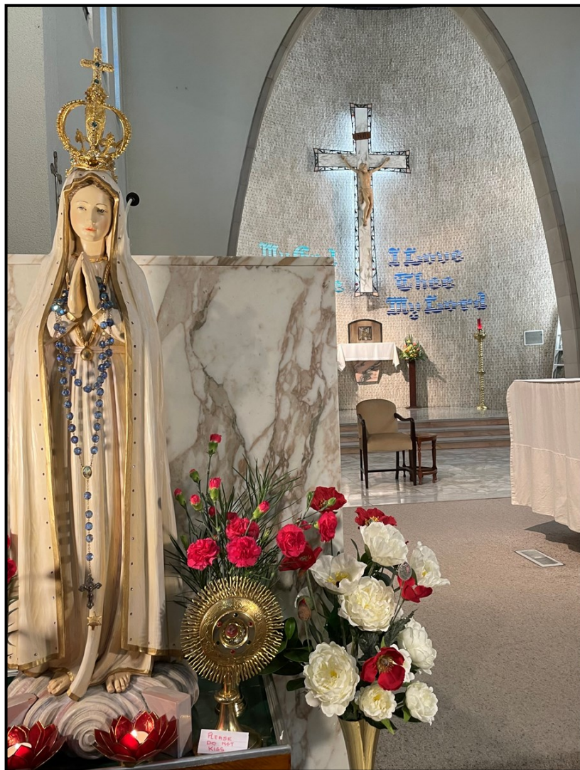
Pilgrim Statue of Our Lady of Fatima visits St Anthony's Church, Glen Huntly

PLEASE RING/EMAIL THE PARISH OFFICE IF YOU WOULD LIKE TO RECEIVE THE PARISH NEWSLETTER BY EMAIL