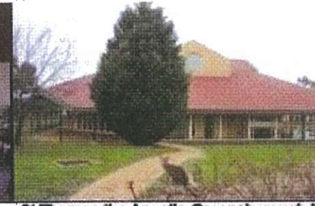
St Thomas the Apostle Greensborough