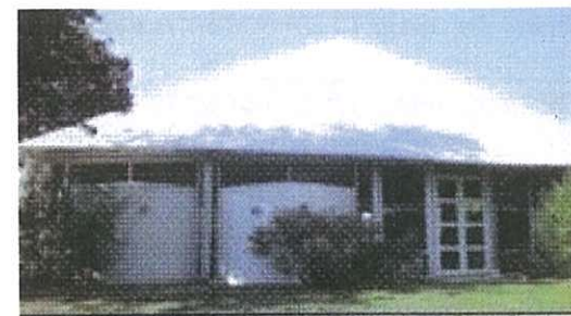
Sacred Heart Church Diamond Creek

The psalm responses are from the English Translation of the Lectionary for the Mass ©1981 International Committee on English in the Liturgy Inc.(ICEL). All rights reserved. The psalm texts, from The Psalms, A New Translation, ©1963 by The Grail, England and used by permission of the publishers. The scriptural quotations are taken from the Jerusalem Bible, published and copyright 1966, 1967 and 1968 by Darton Longman and Todd Ltd and Doubleday & Co Inc, and used by permission of the publishers. © Creative Ministry Resources Pty Ltd All use must be in accordance with your user licensing agreement.