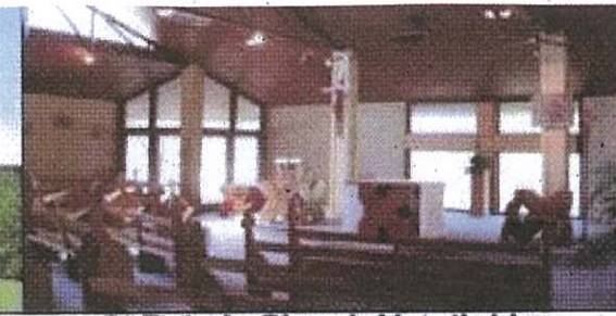
St Peter's Church Hurstbridge