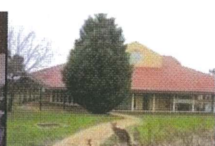
St Thomas the Apostle Greensborough