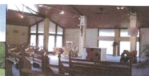
St Peter's Church Hurstbridge