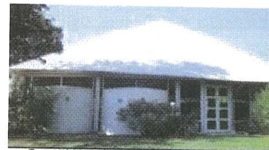
Sacred Heart Church Diamond Creek

The psalm responses are from the English Translation of the Lectionary for the Mass ©1981 International Committee on English in the Liturgy Inc.(ICEL). All rights reserved. The psalm texts from The Psalms, A New Translation, ©1963 by The Grail, England and used by permission of the publishers. The scriptural quotations are taken from the Jerusalem Bible, published and copyright 1966, 1967 and 1968 by Darton Longman and Todd Ltd and Doubleday & Co Inc. and used by permission of the publishers. © Creative Ministry Resources Pty Ltd All use must be in accordance with your user licensing agreement.