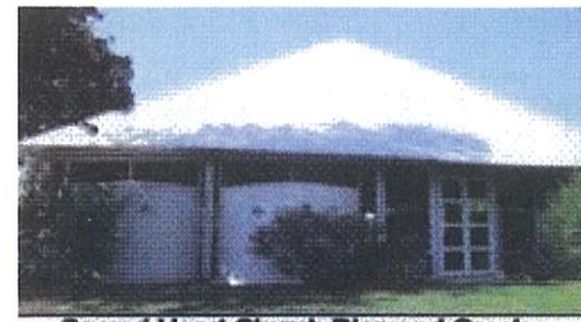
Sacred Heart Church Diamond Creek

The psalm responses are from the English Translation of the Lectionary for the Mass ©1981 International Committee on English in the Liturgy Inc.(ICEL). All rights reserved. The psalm texts, from The Psalms, A New Translation, ©1963 by The Grail, England and used by permission of the publishers. The scriptural quotations are taken from the Jerusalem Bible, published and copyright 1966, 1967 and 1968 by Darton Longman and Todd Ltd and Doubleday & Co Inc, and used by permission of the publishers. © Creative Ministry Resources Pty Ltd All use must be in accordance with your user licensing agreement.