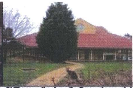
St Thomas the Apostle Greensborough