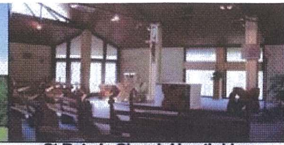
St Peter's Church Hurstbridge