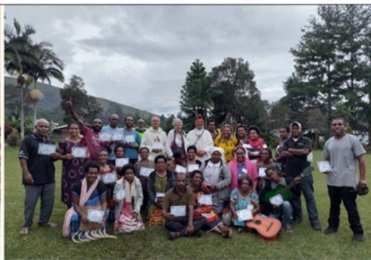
“Moses - Beyond the Desert” course