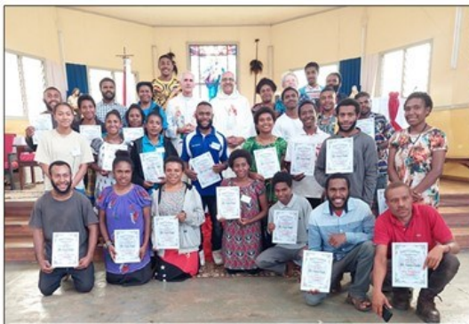
“John the Beloved Disciple” course