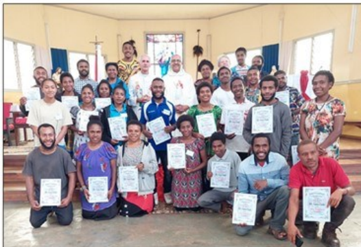
“John the Beloved Disciple” course