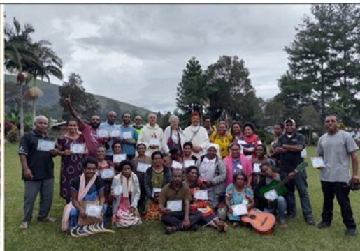
“Moses - Beyond the Desert” course