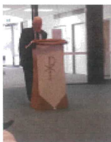
2018 Photos inserted

At – St Gregories the Great Church. 71 Williamsons Road. Doncaster.