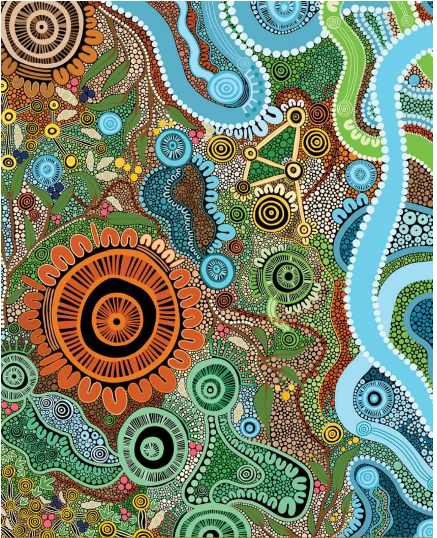
Artwork: Care for Country by Magge-Jean Douglas (Dubb Dubbi)

When creating 'Care for Country' I kept in mind that this meant spiritually, physically, emotionally, socially and culturally—I chose to create a bright and vibrant artwork that included the different colours of the land but showed how they come together in our beautiful country and to make people feel hopeful for the future. I've included communities, people, animals and bush medicines spread over different landscapes of red dirt, green grass, bush land and coastal areas to tell the story of the many ways country can and has healed us throughout our lives and journeys.