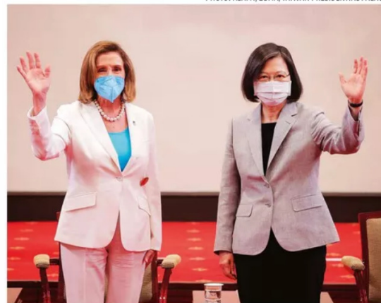
US House Speaker Nancy Pelosi and Taiwan President Tsai Ing-wen meet in Taipei

crisis to blow over, it has misread China.