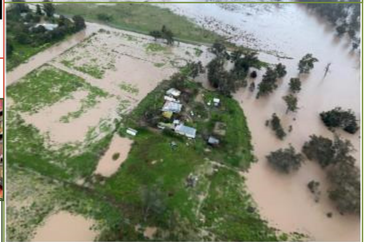
Flooding in Gunnedah, New South Wales, Australia, September 2022. Photo: NSW SES

Image: https://www.9news.com.au/national/weather-australia-2022-wild-weather-extremes-in-pictures-bushfires-floods-snow-storms/84f1601e-2854-4dc2-a3a9-ddf04a8b6452#4