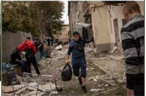
Residents collecting belongings from a destroyed apartment block in Kharkiv the morning after evictions of the building on Sept. 12.