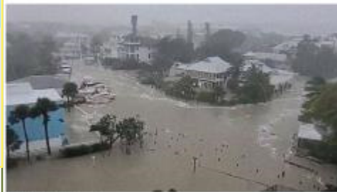
Hurricane Ian has caused severe flooding conditions in Ft. Myers, Fla., as seen in an a... Read More

About 78% of Lee County is without power, and several people are stranded due to high water, officials from Lee County Emergency Management announced during a press conference Wednesday afternoon.