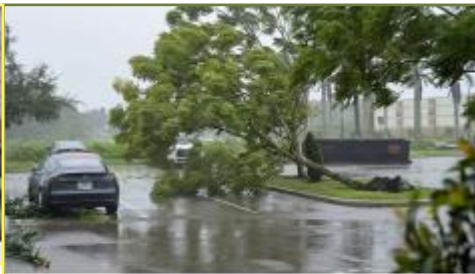
Guests from Hurricane Ian begin to knock down small trees and palm fronds in a hotel pool... Read More