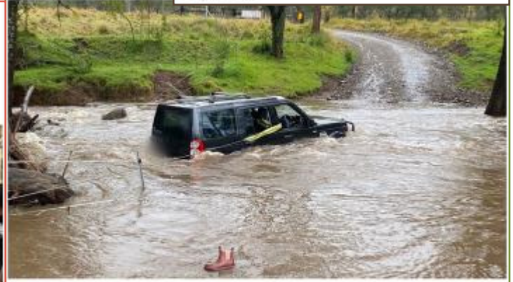
Meanwhile three people were rescued by a police officer after their car was stuck in floodwaters in NSW's Hunter region.

Fuel & Food prices soar...