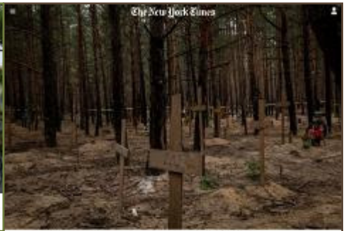
A forest of tall, thin trees that has been planted to honor the fallen... Read More